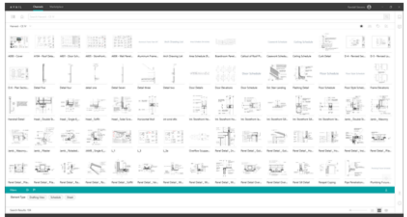
Example strategy for Revit container libraries